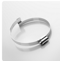
Clip-Grip Hose Clamp, screwable Screwable clamp for attaching all hose types from the Master-Clip series to mobile and stationary systems