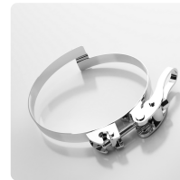
Clip-Grip Quick-Fix Clamp Special clamp for attaching all hose types from the Master-Clip series to mobile and stationary units.