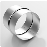
Hose connector Sheet steel connector for extending, connecting and joining light to medium-weight hoses