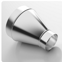
Hose Reducer, symmetrical Hose reducer for extending, connecting and joining light to medium weight hoses