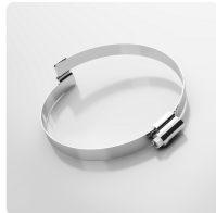
Master-Grip Hose Clamp, screwable Special clamp for fastening light and medium-weight, right-handed spiral hoses such as Flamex B-se, Flamex B-F se, Master-PUR Trivolution, Master-PVC and Master-SANTO