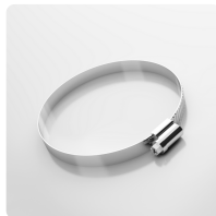
Hose Clamp with Worm-Gear Standard clamp for fastening light hose types to connecting pieces on mobile and stationary installations